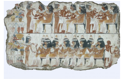
The banquet: fragments of wall painting from the tomb of Nebamun

The next picture was a repetitive pattern. I noticed that all the ladies were wearing cones on their head. I read that these cones are made of wax. The reason the ladies wear them is because they let out perfume.