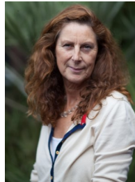
Miss Elaine 1:1 support