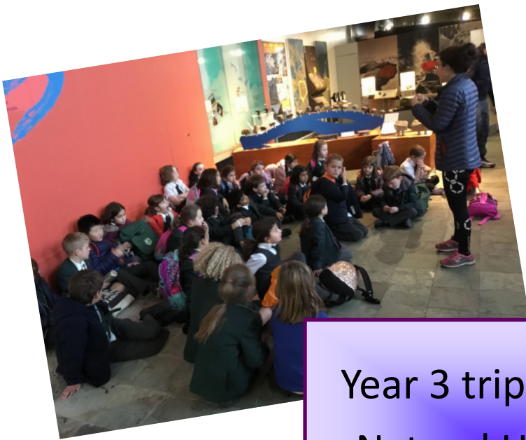
Year 3 trip to the Natural History Museum

For more information please click here .