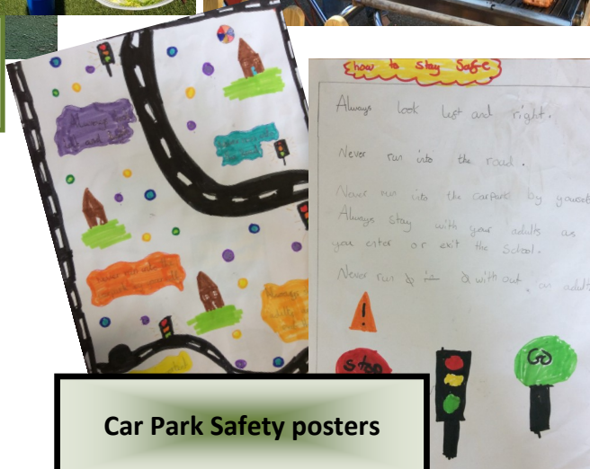
Car Park Safety posters