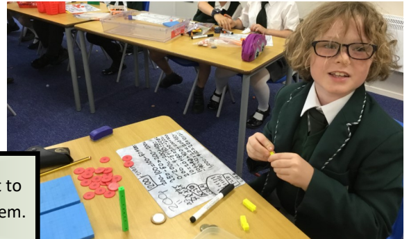
Maths taking place in Muntjac class—it's great to see the children using manipulatives to help them.