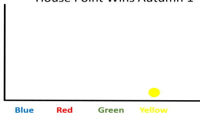
House Point Wins Autumn 1

Adults £7, Kids £3 and under 2's free Ticket will include a burger, hot dog or vegetarian option, squash & ice lolly for the kids, tea, coffee and cake for the adults. There will be a paid bar with beer, wine and fizzy and some games to keep you entertained.