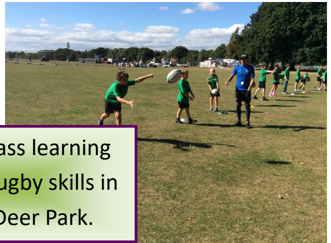
Sika class learning some rugby skills in Old Deer Park.