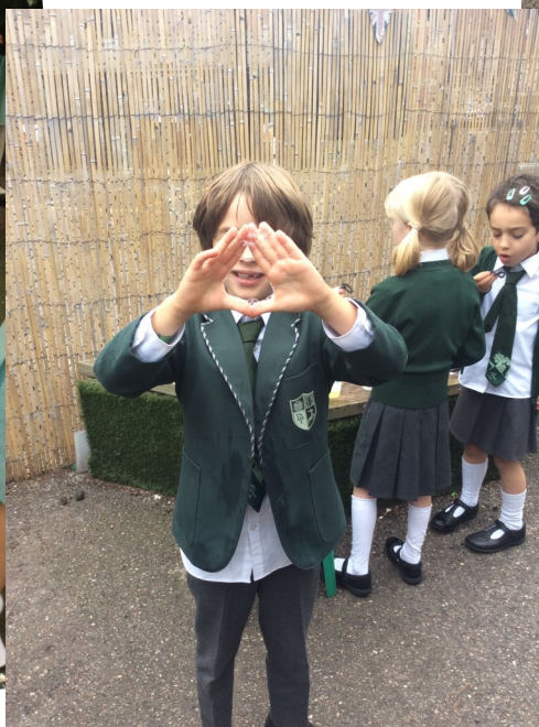
Marsh Class have been conducting a scientific investigation to find out which bubble mixture makes the best bubbles.