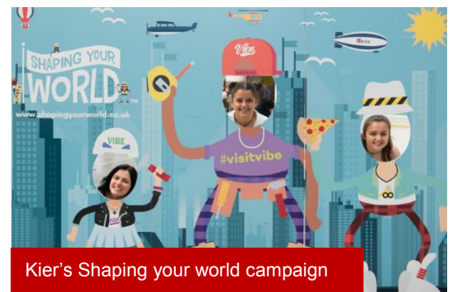
Kier's Shaping your world campaign

For more information regarding this project please go to :