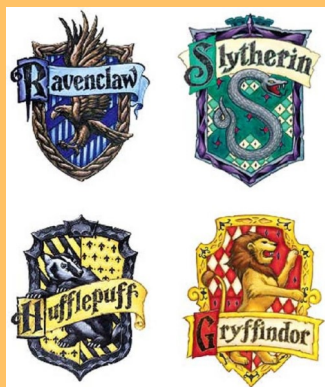
House Point Wins Summer 1

School Council will leave a consultation board in the main office—so please do come and add your suggestions on—we would like everyone to be involved.