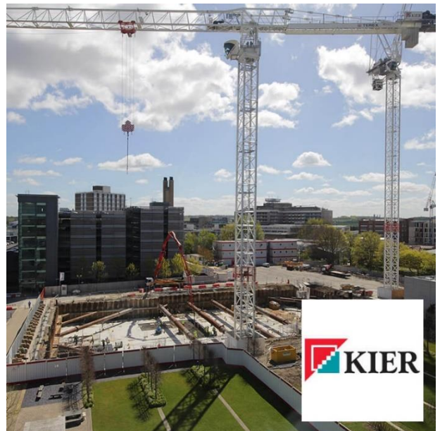
Example of Kier Tower crane in action

As you will be undoubtable aware, Thames Water are currently carrying out emergency works along Richmond Road due to a blocked sewer main.