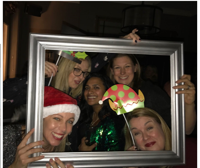
The PTA Committee (minus 2)